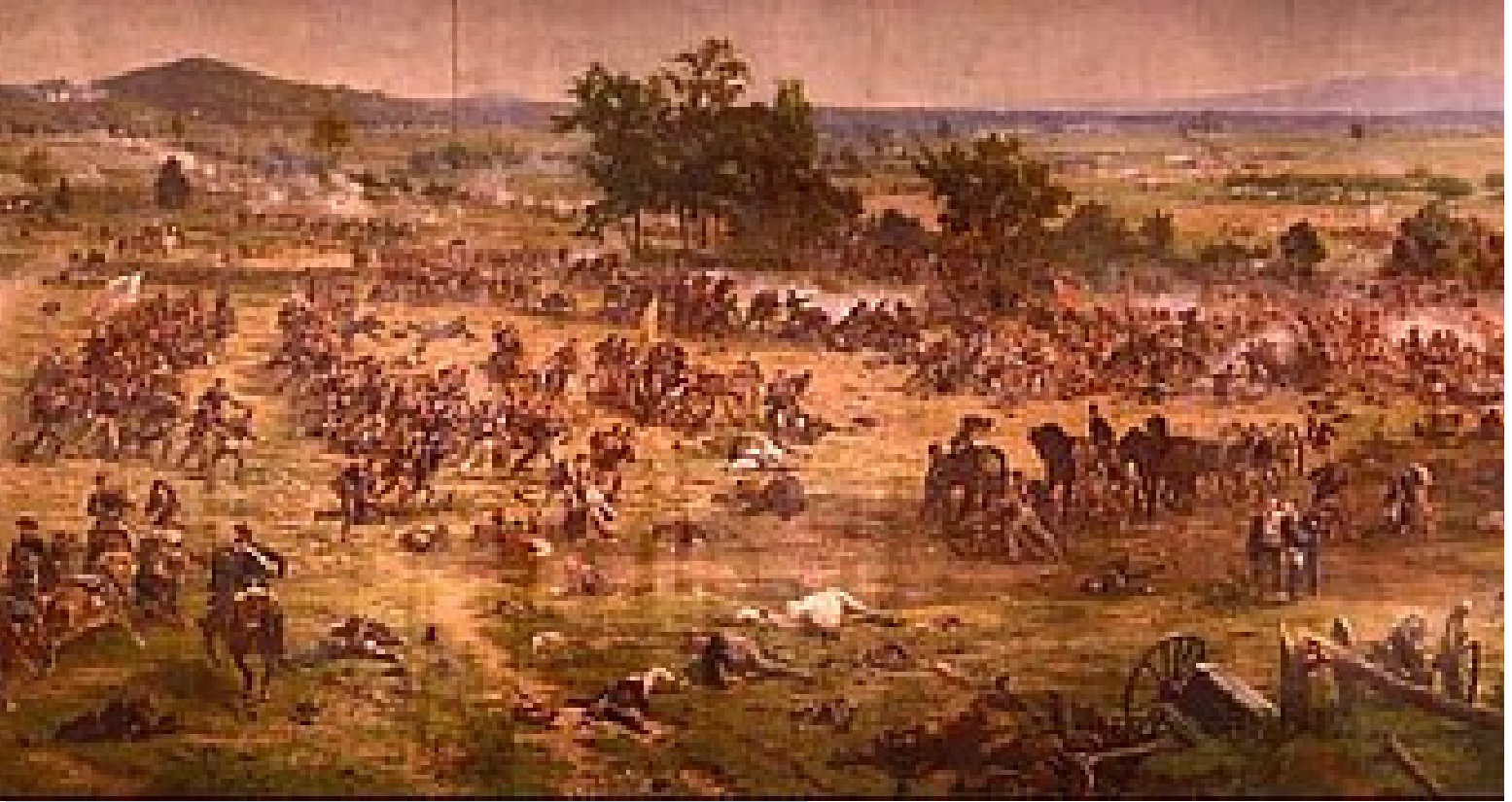
The Battle of Gettysburg by Paul Philippoteaux (1883)